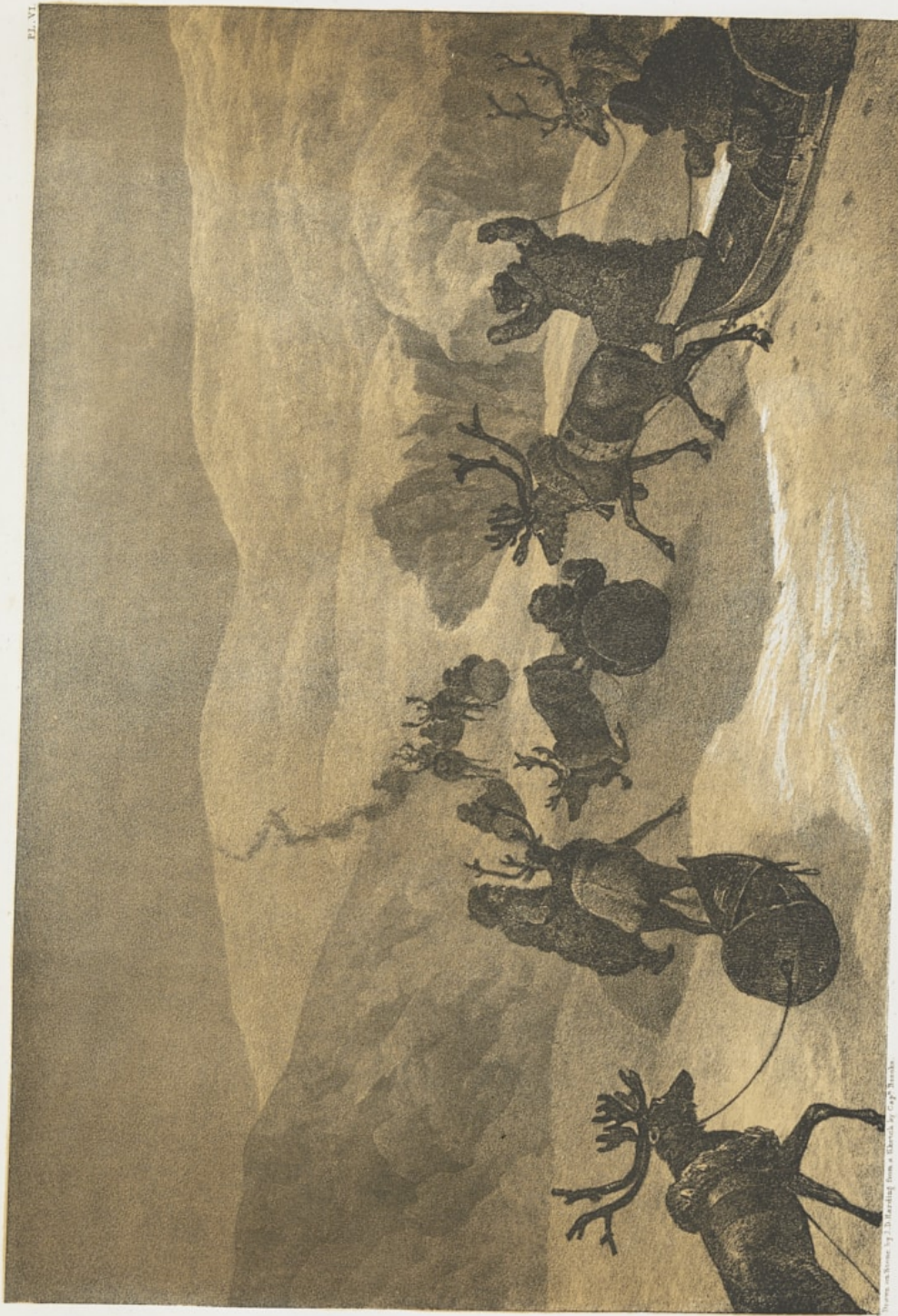
From a drawing by J. Murray, after a sketch by Capt. Baines.

SCENERY OF THE FINNMARK ALPS; DIFFICULTY OF CROSSING A GLACIER, WITH REIN DEER ON ACCOUNT OF THE SLIPPERINESS OF THE SURFACE.