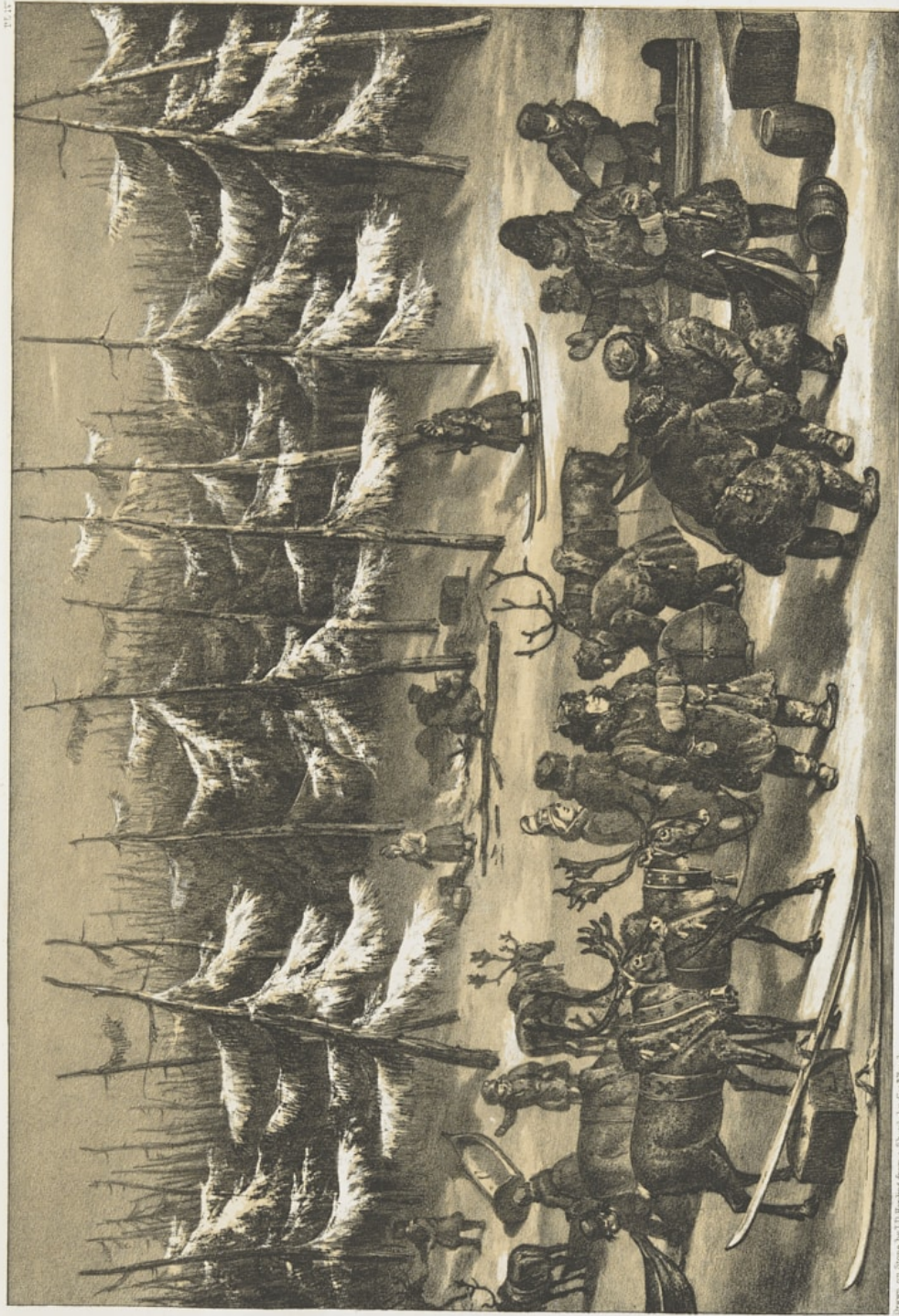
The Figures & Animals by P. Dighton.