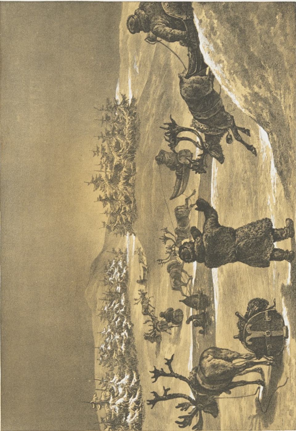
The figures sketched by J. B. S. P.