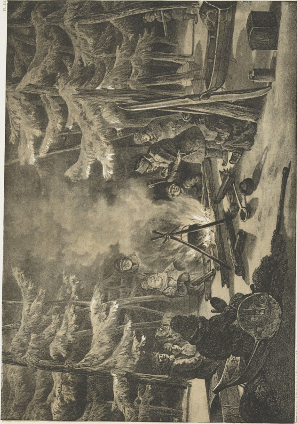
The Figures by D. Hughes