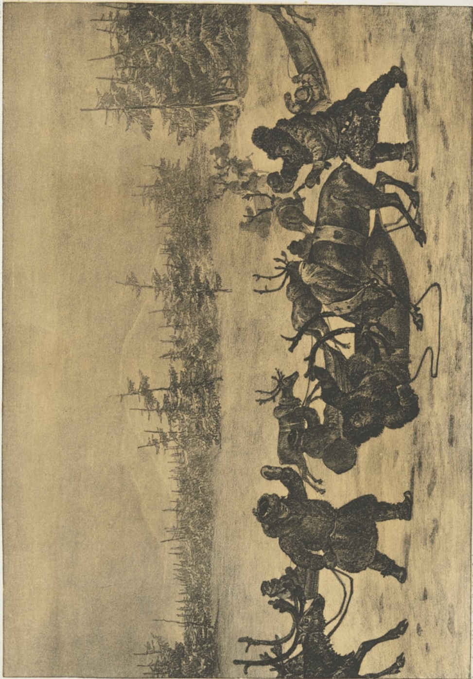
The Figures Examined by Dr. Simpson