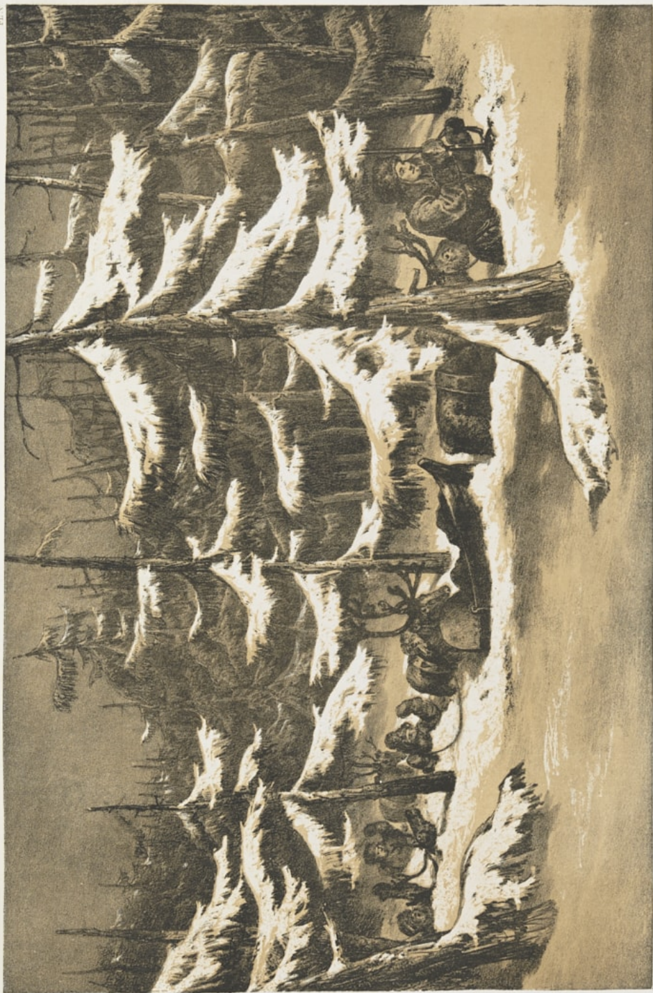
The figures & animals by J. B. Sowerby

CONTINUATION DE VOYAGE ET MOYENS QU'EMPLOIENT LES LAIDONS POUR SE FAIRE JOUR AU TRAVERS D'UNE MASSE ÉPAISSE DE NEIGE RECENTEMENT TOMBÉE.